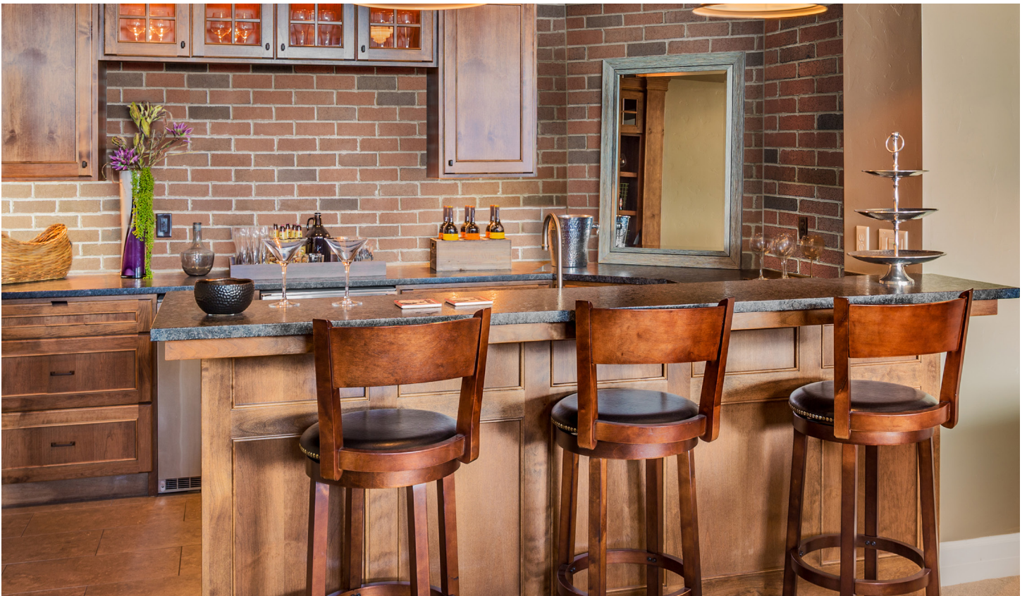
Cambridge and Congress Blend