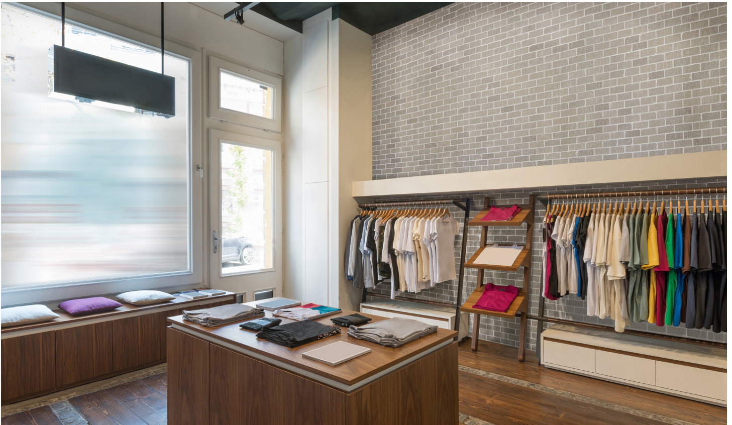
Newbury and Congress Blend